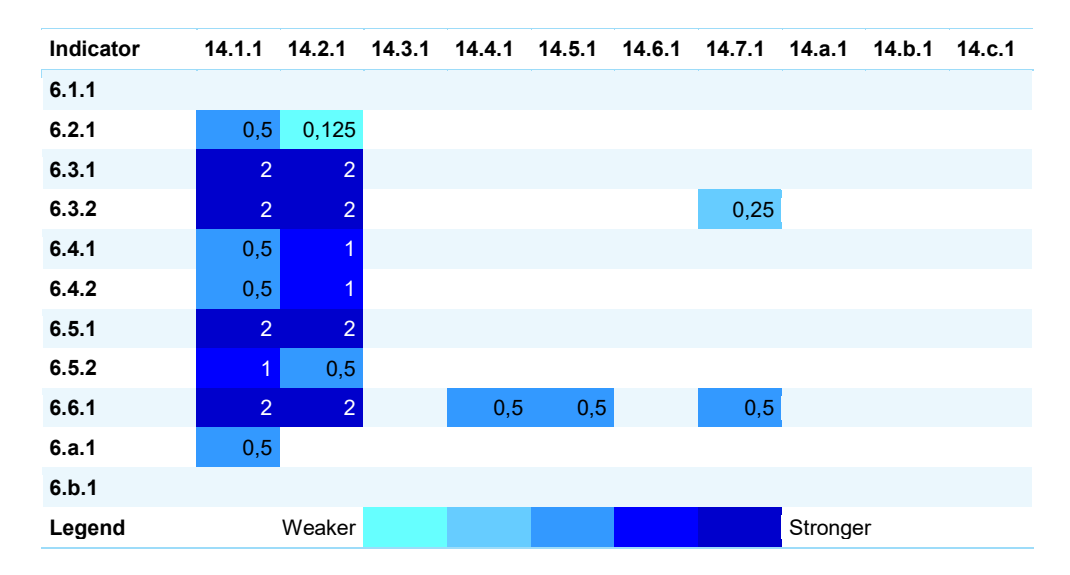
Table 5. Summary of relative strengths of links between SDG 6 and SDG 14.

In this chapter, the physical and potential social links between the targets for SDG 6 and SDG 14 are described and analysed in the light of the proposed indicators for these targets. A full listing of the goals and targets for SDG 6 and SDG 14 is found in Annex 2.